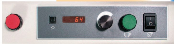
Folder Control Panel

The FD 2092 & FD 2082 are mid-volume units designed to be run by one operator. The FD 2092 bottom air-feed system and 3' high capacity outfeed conveyor allow for uninterrupted loading and unloading of forms. The FD 2082 trims, separates, folds and seals continuous pressure seal forms with minimal setup. Fold plates are manually set to accommodate a variety of forms. Fine tuning knobs enable the operator to get a precise fold every time.