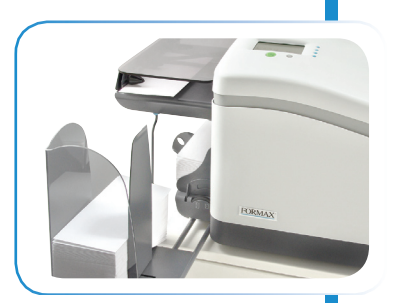
Side exit tray