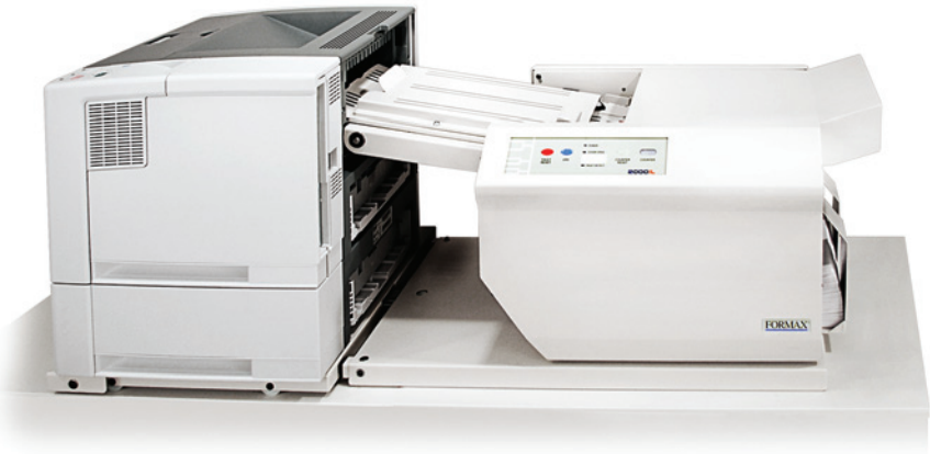
FD 2000IL System shown with IL Pressure Sealer and IL Alignment Base, laser printer (not included), optional conveyor and optional locking cabinets