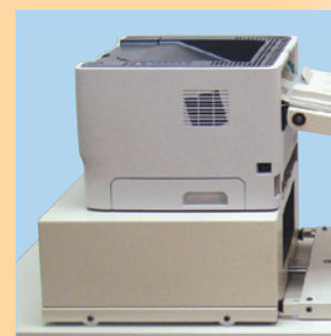
FD 2000-45IL Riser with HP/Troy P2015 Printer

Dimensions w/Cabinets & 18" Conveyor: 20" W x 74" L x 48" H