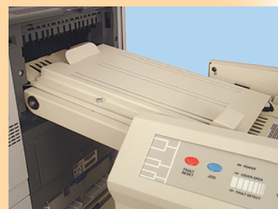
Enclosed paper path provides optimal document security