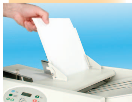
Optional Multi-Sheet Feeder