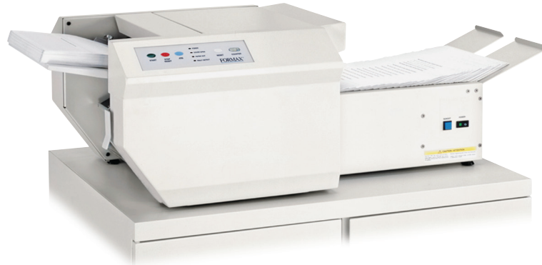
Shown with optional cabinet and 18" conveyor