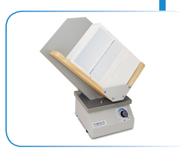
402 Series Jogger - an option which reduces static electricity from forms and aligns them for proper feeding