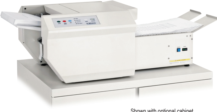
Shown with optional cabinet and 18" conveyor

The FD 2030 AutoSeal<sup>®</sup> desktop pressure sealer provides a reliable and compact solution for processing pressure sensitive self-mailers. Standard features include a six-digit counter, jog control, fault detection, LED indicators and an operator friendly touch-pad control panel. Up to 250 forms can be loaded in the feeder and processed at speeds up to 9,000 forms per hour.