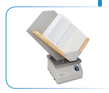
402 Series Jogger - an option which reduces static electricity from forms and aligns them for proper feeding