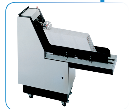
FD 2000-60 Bulk Input Loader (optional for FD 2094)