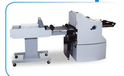
FD 2094 in-line with optional V-Stack36 Vertical Stacker and adjustable stand