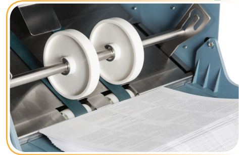
Outfeed Stacking Belt & Rollers: Automatically adjust to paper size. Two tray positions are available.