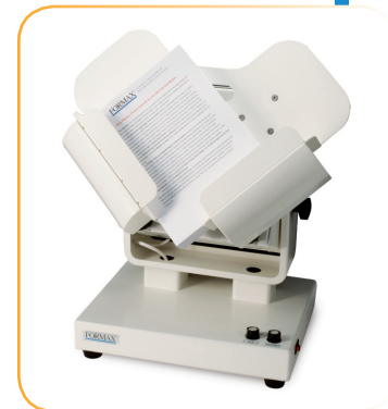
Optional FD 402TA1 Jogger: Air Jogger dries and reduces static electricity from forms and aligns them for proper feeding

Formax - New Hampshire, USA www.formax.com