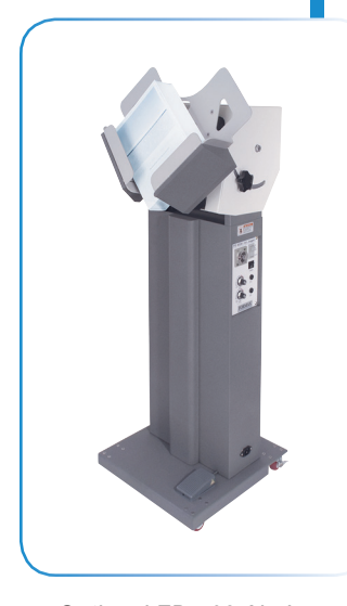
Optional FD 402 Air Jogger -High-capacity air jogger reduces static electricity from forms and aligns them for proper feeding

Formax - New Hampshire, USA www.formax.com