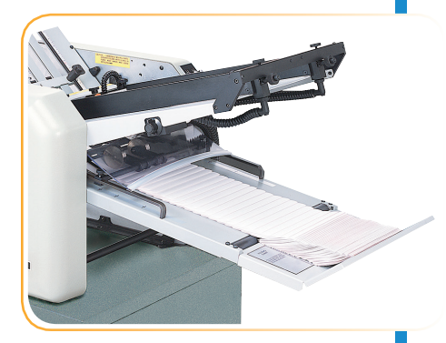
Convenient infeed and outfeed, designed for ease of operation