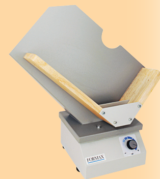
A 402 Series Jogger is a recommended option that reduces static electricity from forms and aligns them for proper feeding