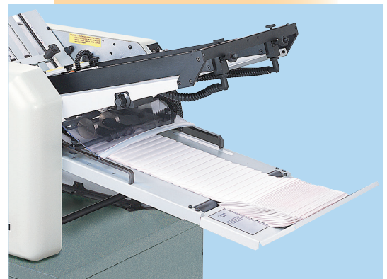
Convenient in-feed and out-feed, designed for ease of operation