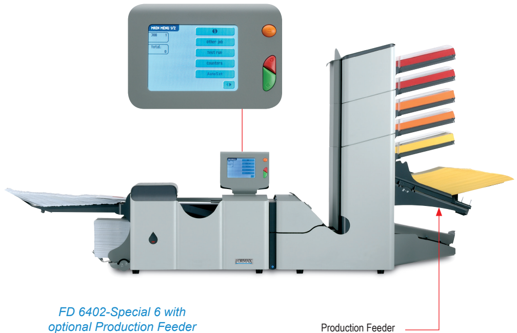
FD 6402-Special 6 with optional Production Feeder