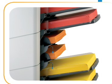
Optional short feed trays