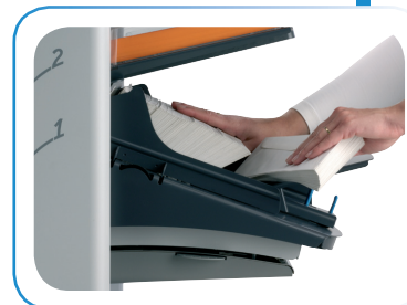
Optional Production Feeder holds 325 BREs or 1,200 sheets