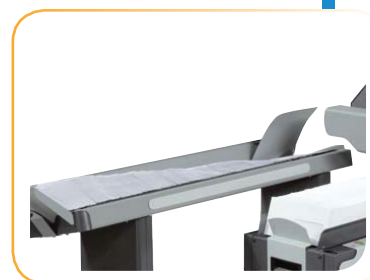
Optional High-Capacity Envelope Hopper and Output Conveyor

Formax - New Hampshire, USA www.formax.com