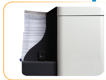
Top-loading Envelope Hopper