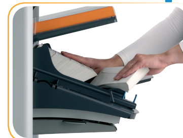
Optional Production Feeder