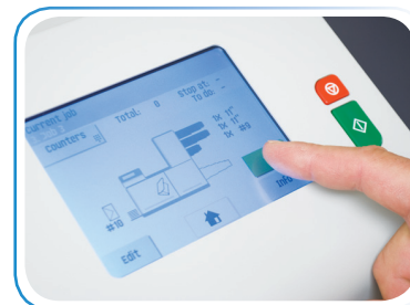
User-friendly color touchscreen control panel

* Paper & envelope specifications may vary. All media must be tested.