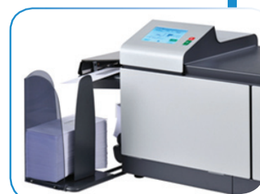
Optional side exit tray