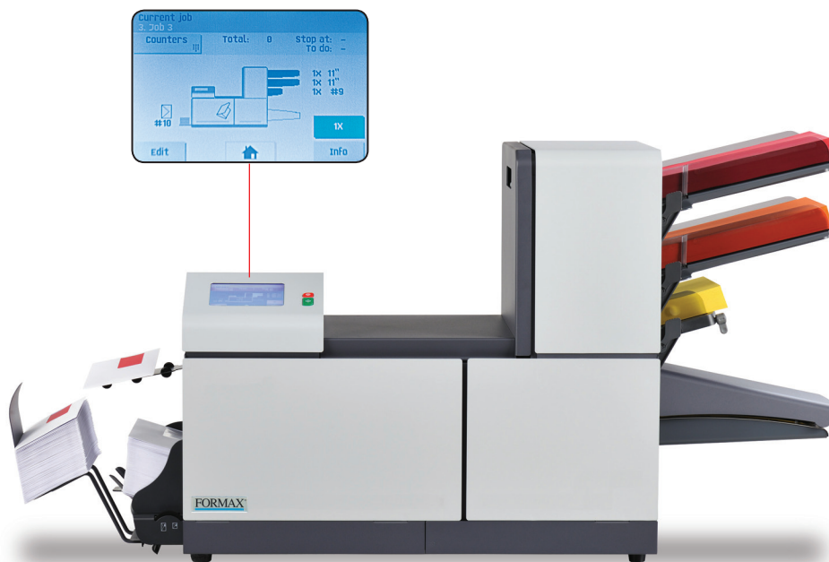
FC 6204-Advanced 2