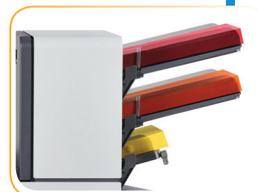
2 sheet feeders and 1 insert/BRE feeder