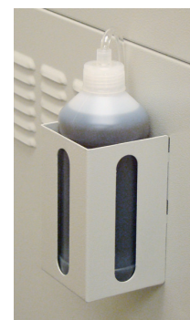
Optional EvenFlow™ Automatic Oiling System