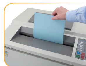
Standard Hopper for hand feeding up to 18 sheets at once