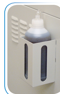
AutoOiler - Automatically pumps oil onto the cutting blades

Visit www.formax.com to watch the product demonstration video