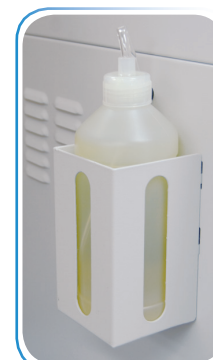
Optional EvenFlow™ Automatic Oiling System

*Capacity varies depending on paper and power supply