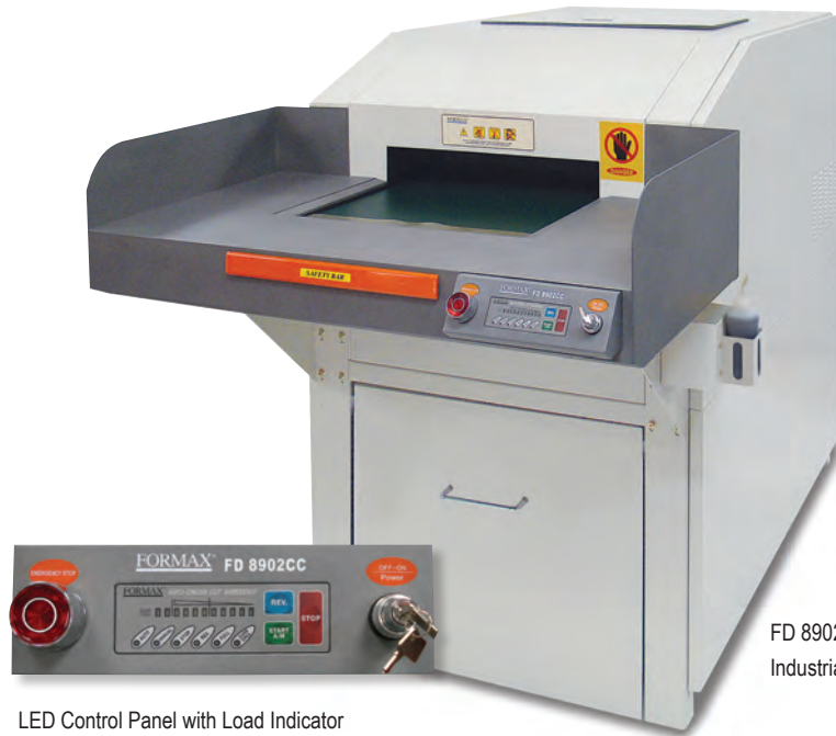
LED Control Panel with Load Indicator