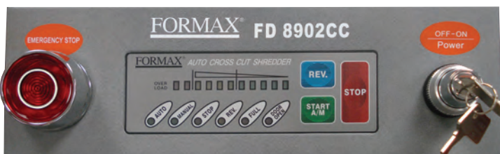
LED control panel with visual load indicator and safety key lock

The FD 8902CC offers unmatched automated features through its LED control panel. The easy-to-read Load Indicator assists operators in determining how close they are to the maximum shred capacity to avoid jams and provide optimal efficiency. Operators can select from two modes of operation: Auto Start/Stop or Manual. Auto Start/Stop mode utilizes optical sensors which detect paper and start/stop operation automatically. Manual mode provides non-stop operation for shredding small sized paper or films. The Safety Key Lock prevents unauthorized use of the shredder.