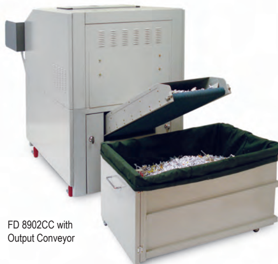
FD 8902CC with Output Conveyor