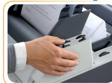
Easy to load feeders