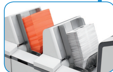
High-Capacity Versatile Feeders (optional)