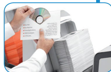
Feeds a variety of media