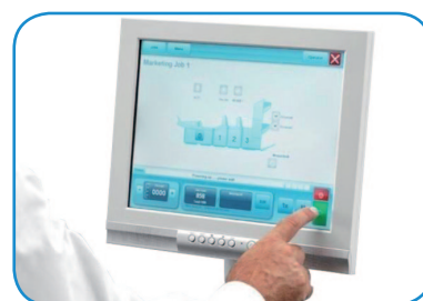
15" Color Touchscreen Interface

* Paper & envelope specifications may vary. All media must be tested.