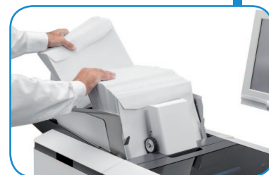
High-Capacity Envelope Feeder