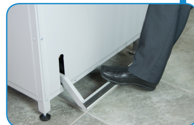
Foot pedal pre-clamp holds paper to check alignment prior to cutting