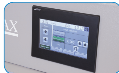
Touchscreen control panel allows for programming up to 100 jobs