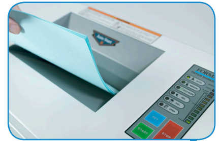
Separate infeed for paper, and user-friendly LED control panel

* Paper Shredder is designed ONLY for paper. No CDs, DVDs, Blu-ray discs, credit cards, staples, or paper clips.