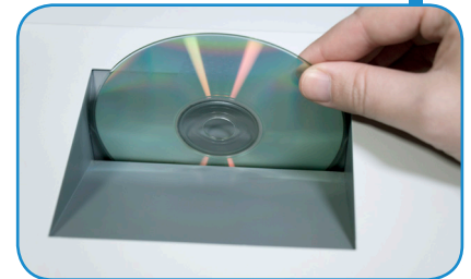
Optical media infeed