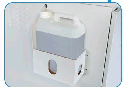
EvenFlow™ Automatic Internal Oiling System

Formax - New Hampshire, USA www.formax.com