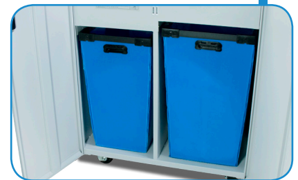
Lifetime guaranteed waste bins made of heavy-duty molded plastic